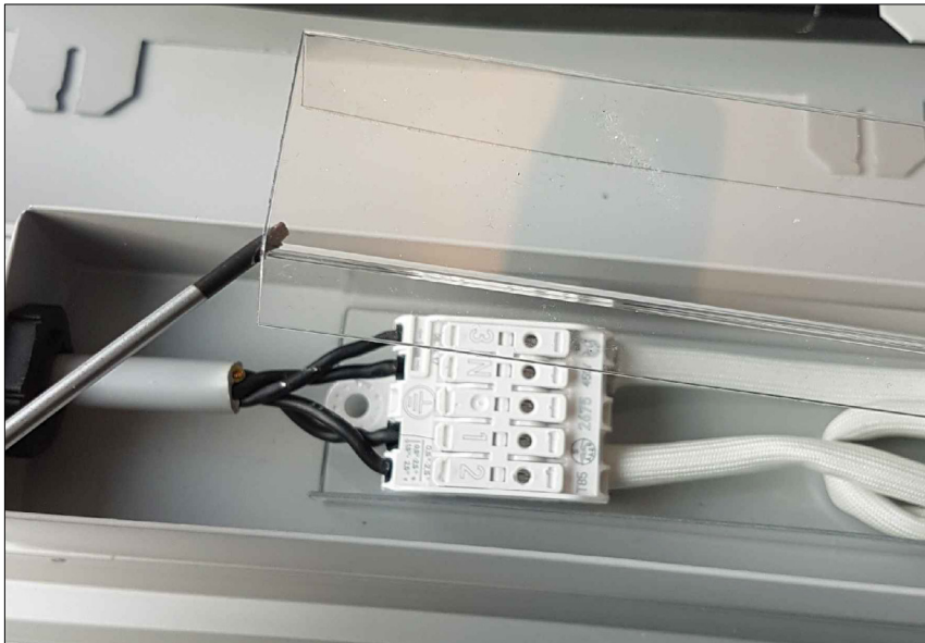
12) replace SKII protection